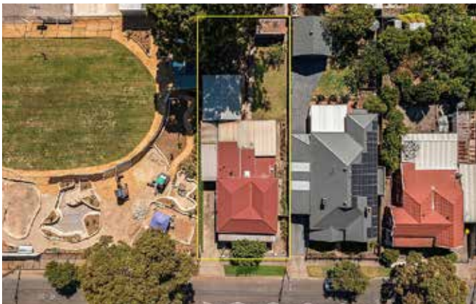
Purchase of 31 Bertie Street, West Hindmarsh