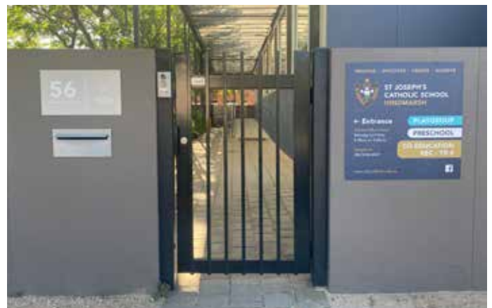
Albemarle Street gate/intercom system